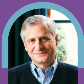
MR. JON MEACHAM