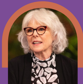
THE REV. BARBARA BROWN TAYLOR

Wednesday, March 15 ~ 6:15 p.m. and Friday, March 17 ~ noon